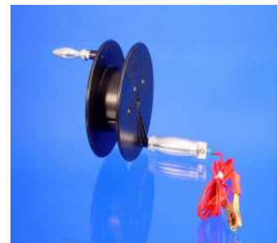
Ex Hand Reel - complete with earthing leads