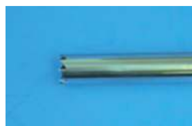
Above- Sharp cutting tip