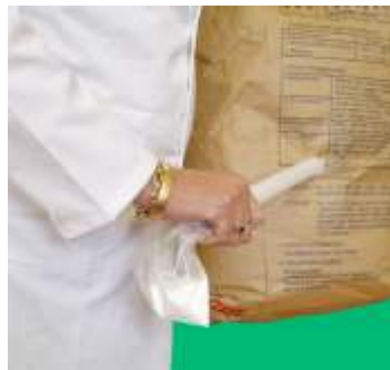
Insert the sampler through the side of the sack.