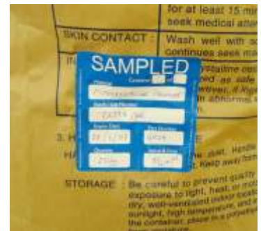
Seal hole with a UA label (See Page 80 for details of our range of UA Labels)

Angle sampler downwards to allow the product to flow into the sample collecting bag