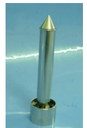
Sampling Chamber in the collecting cup