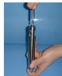
Attach the Handle