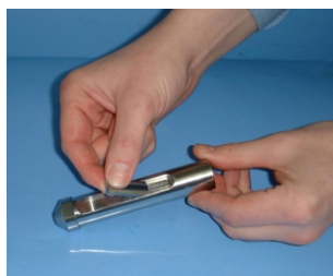
Fit the Inserts to the Sampling Chamber