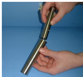
Fit the Sleeve